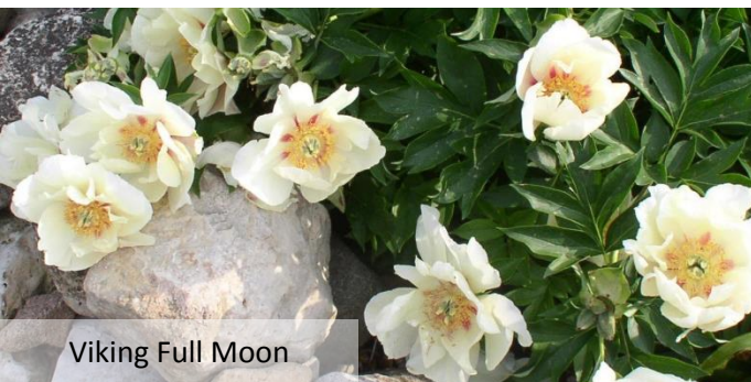
Viking Full Moon