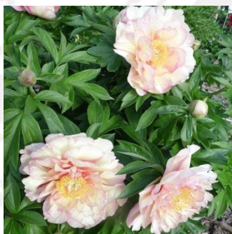
Smith Family Jewel

First Arrival Impossible Dream Pink Double Dandy (Keiko™) Yankee Doodle Dandy