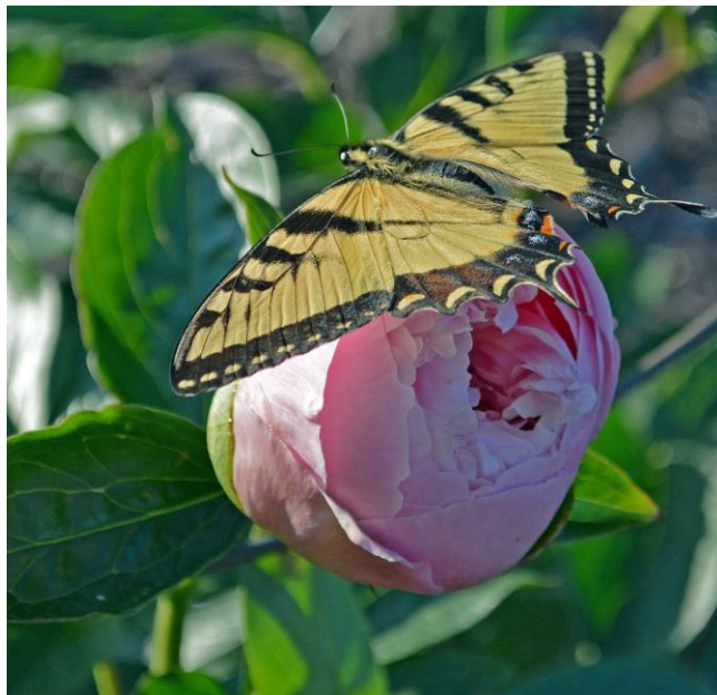
Class 4, Peony Personalities – A swallowtail decided to visit this not quite open Manitowoc Maiden bud.