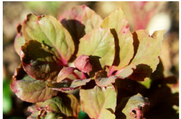
Figure 1f. Hybrid foliage