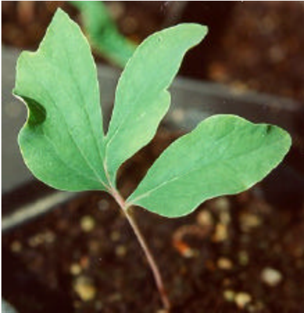
Figure 1c. Hybrid seedling