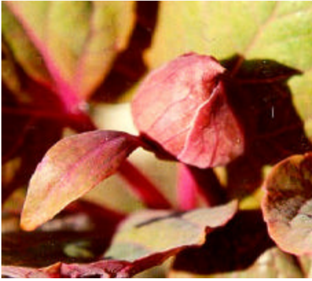
Figure 1a. Hybrid flower bud