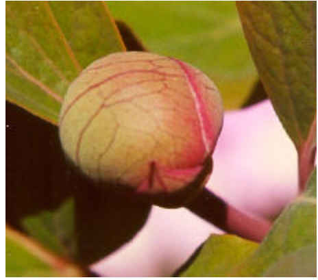
Figure 1b. Mloko flower bud