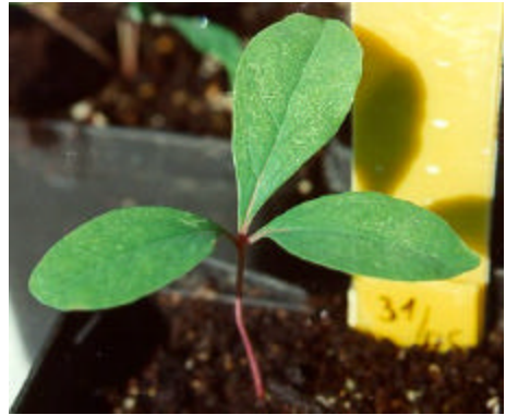
Figure 1d. Mloko seedling