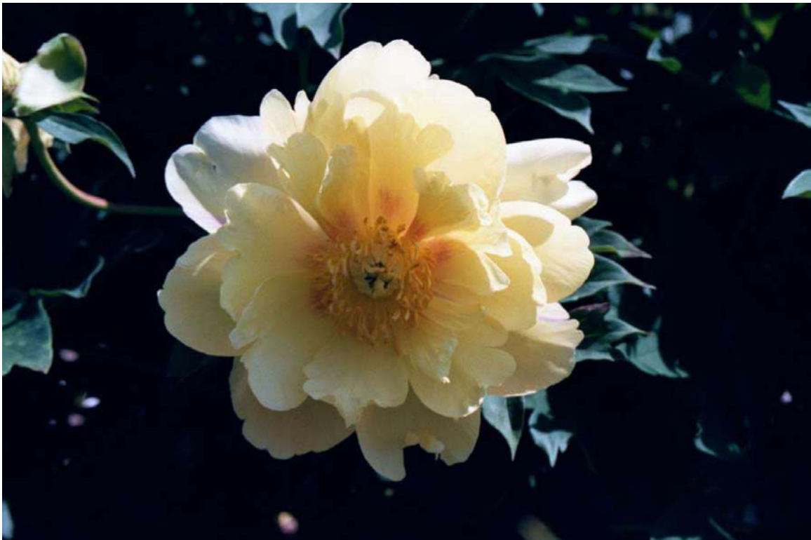
Seedling # IC-92-03, Parentage: (Martha W. x Golden Era)