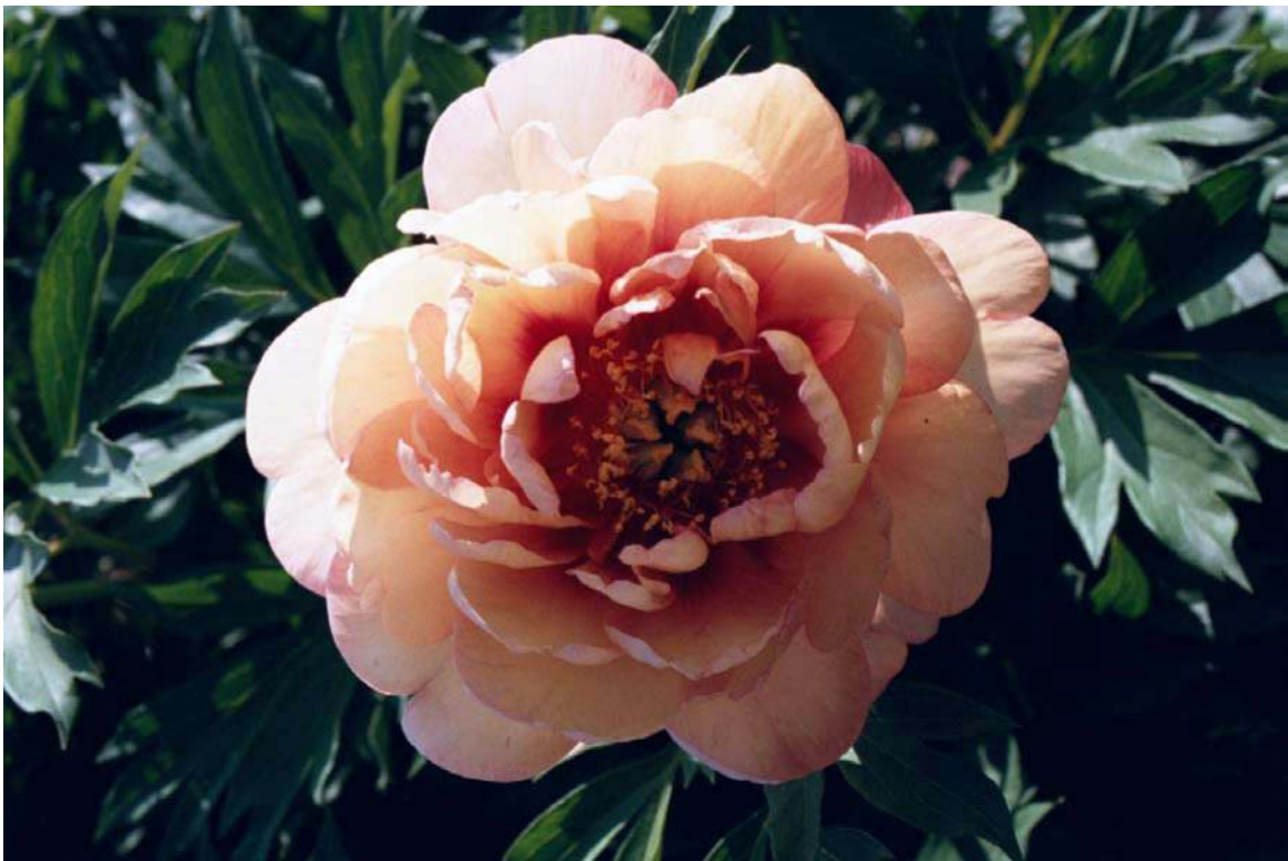
Seedling # IC-95-21R, Parentage: (Martha W. x Golden Era)