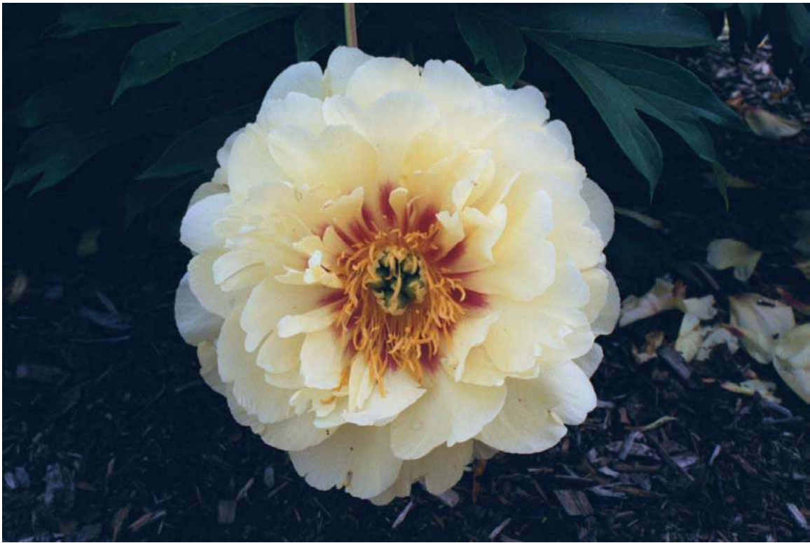
Seedling # IC-93-21, Parentage: (Martha W. x Golden Era)