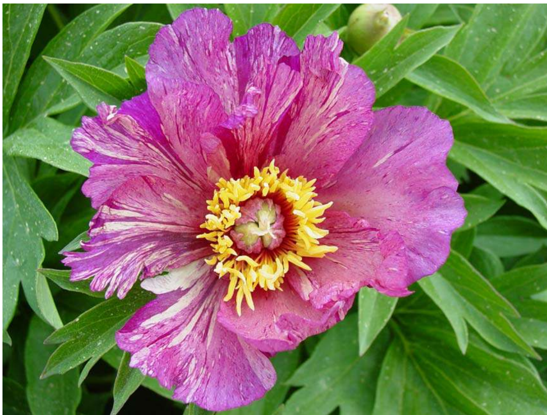
Fig. 1. Smith Intersectional Hybrid Seedling # IC-94-24 ( Martha Washington x Golden Era )