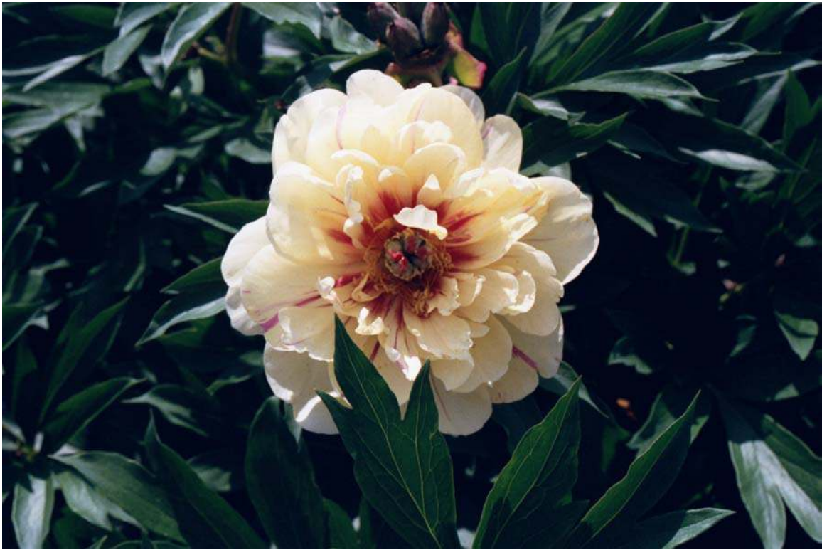
Fig. 2. Smith Intersectional Hybrid Seedling # IC-95-23, Parentage: ( Martha W. x Golden Era )