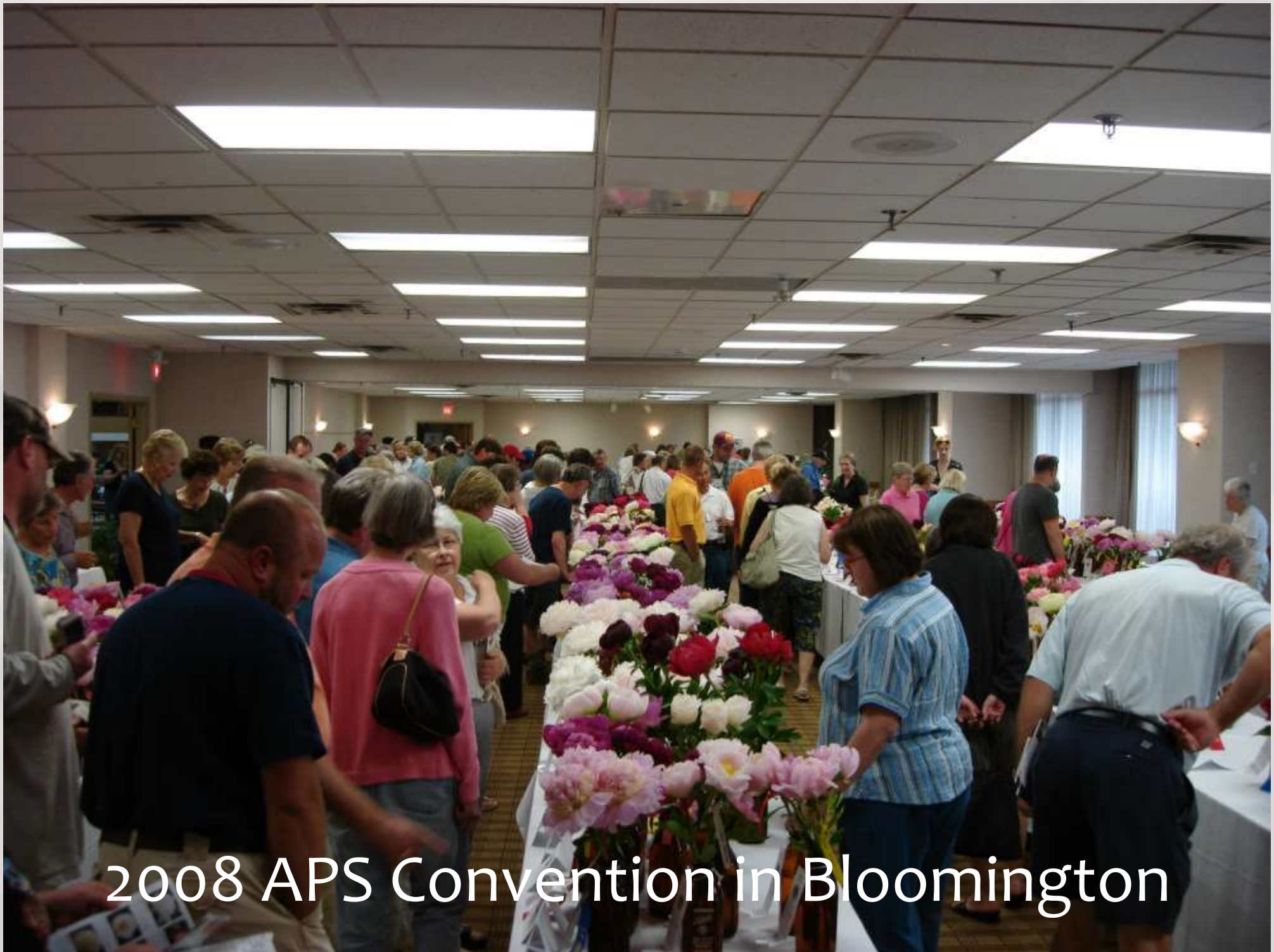
2008 APS Convention in Bloomington